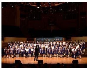
Hong Kong Children's Choir