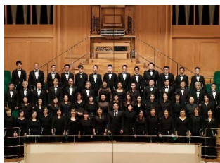
Hong Kong Philharmonic Chorus