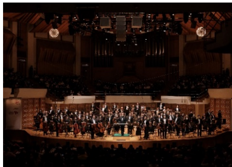
Hong Kong Philharmonic Orchestra