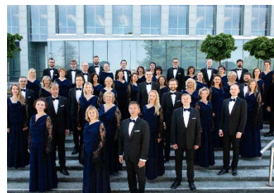
State Choir Latvia