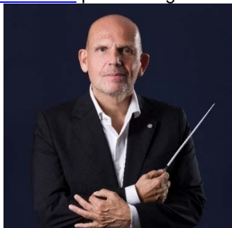
Jaap van Zweden