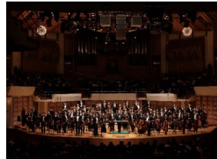
Hong Kong Philharmonic Orchestra