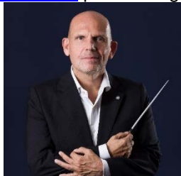
Jaap van Zweden