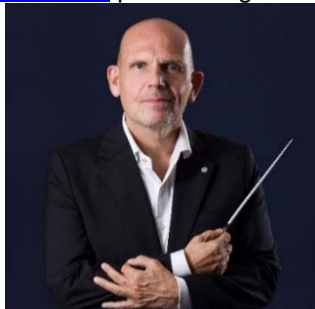
Jaap van Zweden