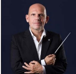
Jaap van Zweden